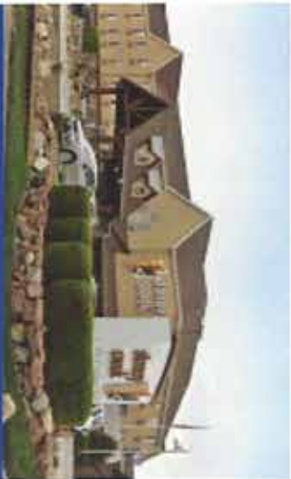
Stoney Creek Hotel

Attendees are responsible for securing their own lodging. A block of rooms are being held until April 2, 2019