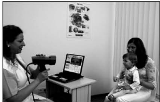
The new PlusOptix Vision Screener can screen children with no film, producing immediate results.

In the upcoming months we will be working on finding efficient and cost-effective ways to screen the most children possible while also keeping Lion club volunteers at the heart of this program. We look forward to the new challenge ahead of saving the sight of even more children in Missouri!