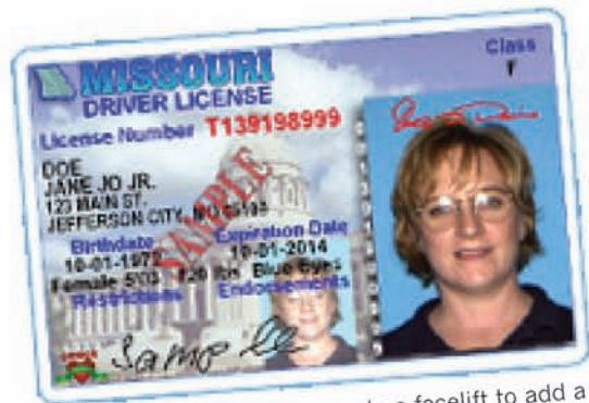
Missouri's driver license gets a facelift to add a symbol indicating presence on the donor registry.

Join the Foundation and Heartland Lions Eye Banks in promoting the new Missouri donor registry in your community. Brochures, registration forms and promotional cards are available from your Sight Committee representative or by contacting our PR department at 800-283-1982 or info@mlefrf.org .