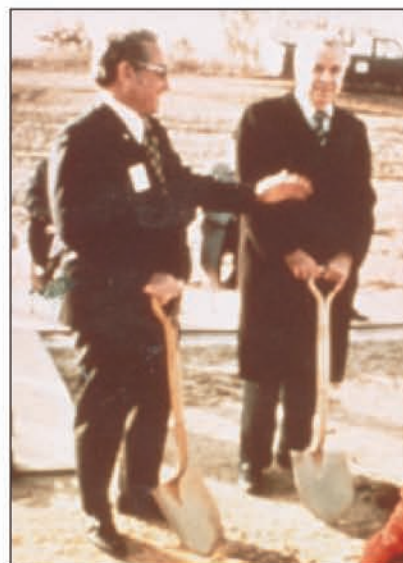
Eye Bank Groundbreaking

Our partnership with the Lions began in 1960 when the Lions joined forces with the University of Missouri - Columbia to form the Lions Eye Tissue Bank. In 1972, the Eye Research Foundation of Missouri was designated a not-for-profit organization and opened our present headquarters in Columbia just a few short years later. In 1987, the Lions voted to accept financial responsibility for the program, creating the Missouri Lions Eye Research Foundation we know today.