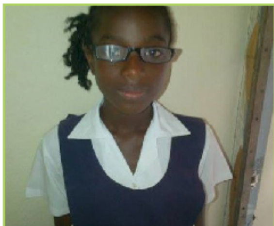
Many students from the local community received glasses to help them succeed in school.