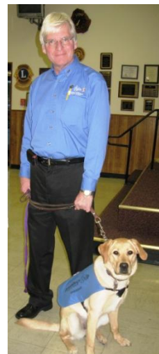
Leader Dog in Training