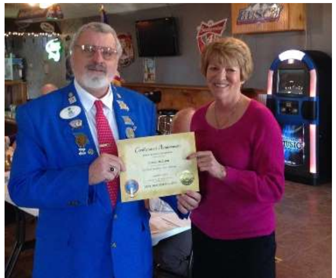
Columbia 20/20 Lions Club Celebrates 25 th Anniversary