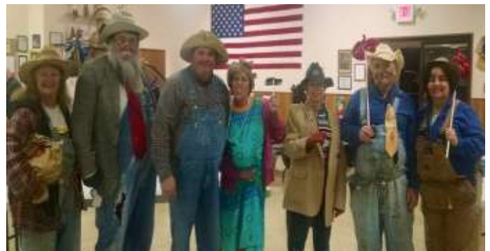
District M6 "Hobo Days" in Branson, MO.