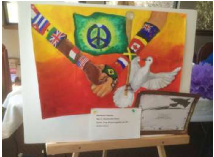
District 26-M1 Peace Poster Winner