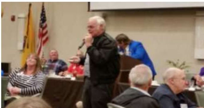
District Governor Pays to get his Gavel back.