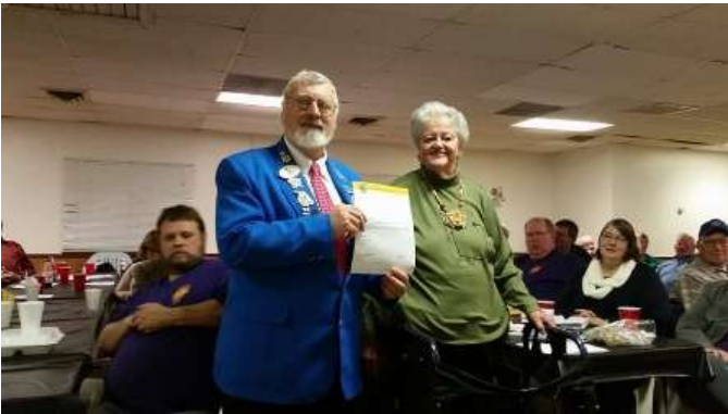
Zone Meeting at Moscow Mills