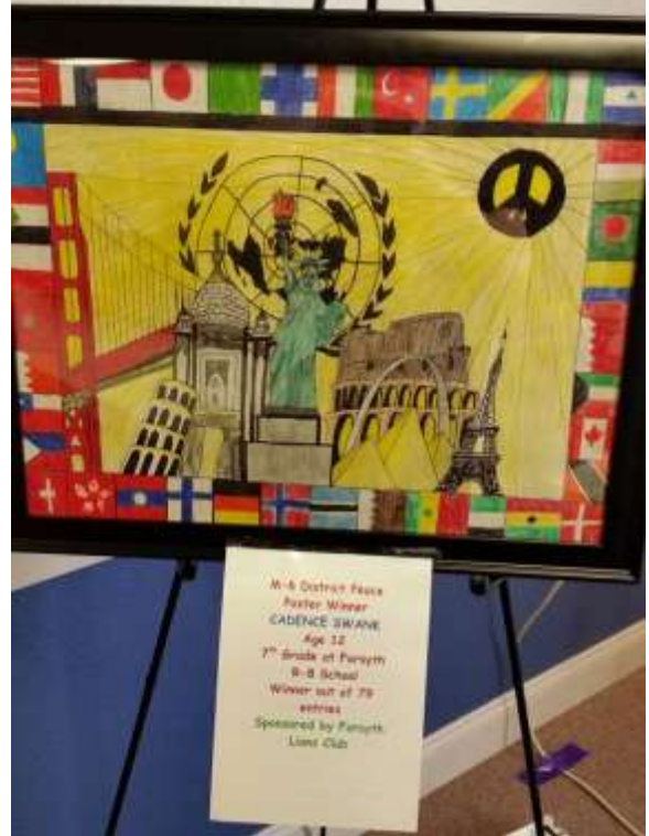
2016 District M6 Peace Poster Winner