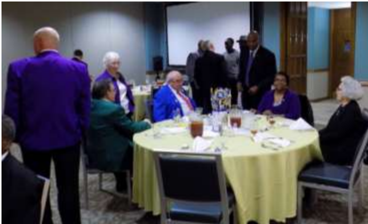
2016 District 26-M1 Convention