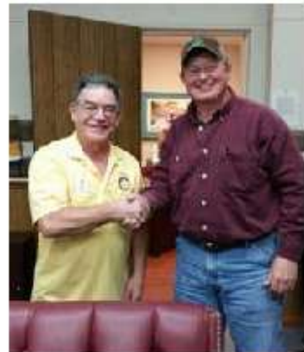
Houston Lions treat local police to lunch