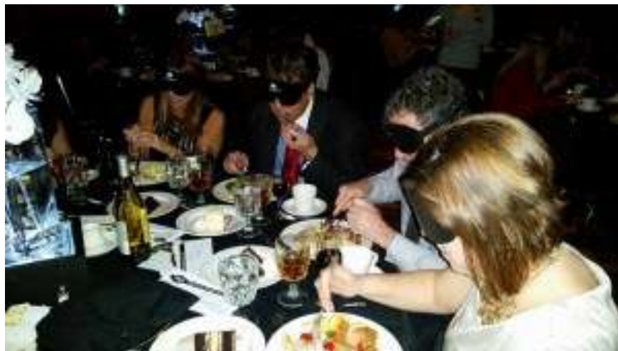
“Dining in the Dark” another successful event fpr

Above on the right: Vision Rehabilitation of the Ozarks (VRCO) “One Dollar Hot Dog Night at the Baseball Game” with the Springfield Cardinals.