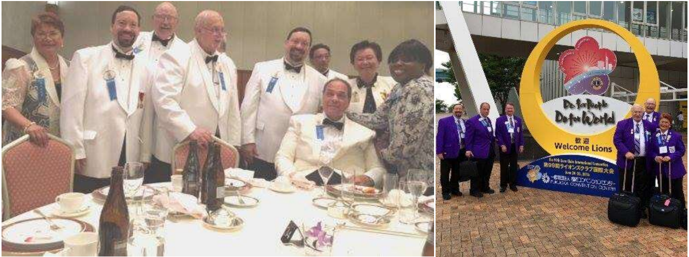
Pictured above (left) MD 26 DGE's celebrate graduation from their training class in Fukuoka, Japan.